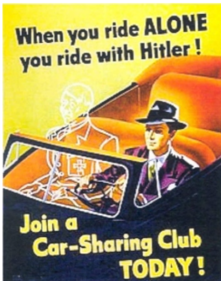
A poster used to promote carpooling as a way to ration gasoline during World War II

By having more people using one vehicle, carpooling reduces each person's travel costs such as fuel costs, tolls, and the stress of driving. Carpooling is also seen as a more environmentally friendly and sustainable way to travel as sharing journeys reduce carbon emissions, traffic congestion on the roads and the need for parking spaces. Authorities often encourage carpooling, especially during high pollution periods and high fuel prices.